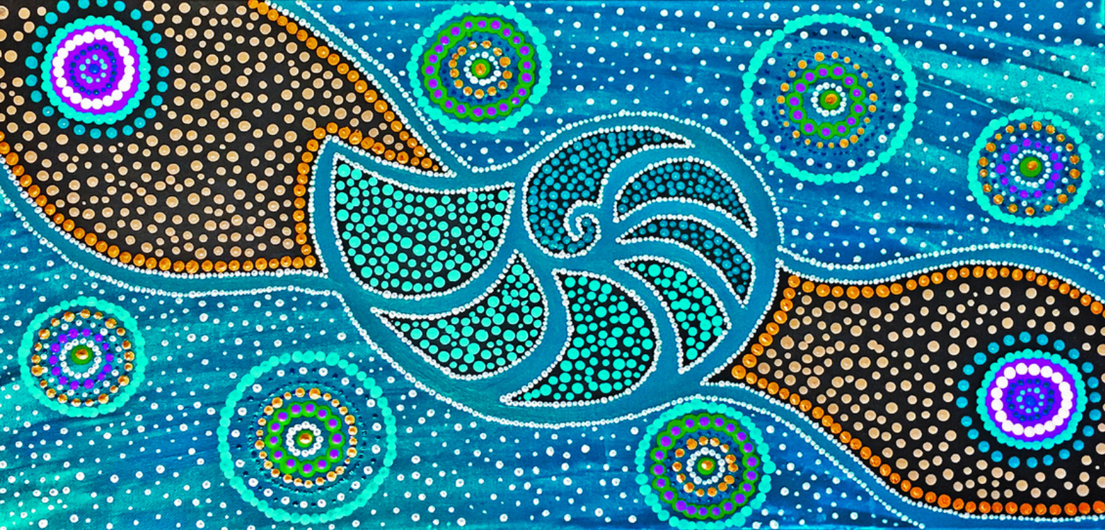
'Nautilus' by Lynnice Keen